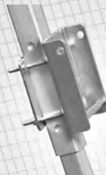
7291B Leg Bracket